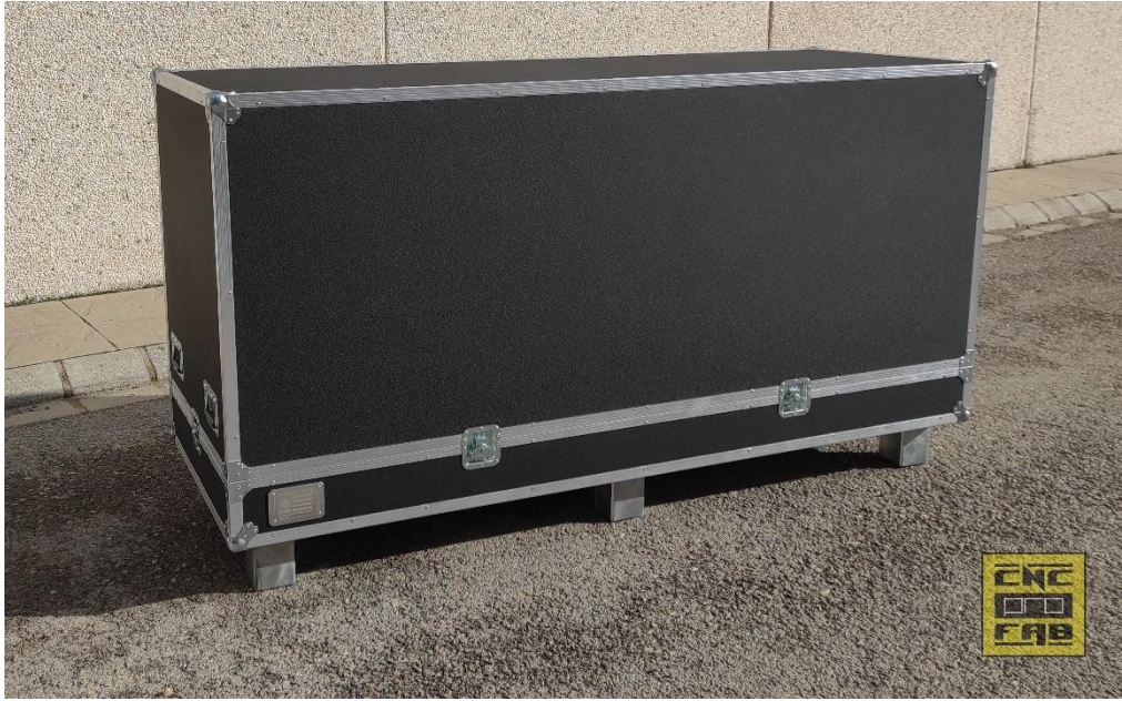
PT6C-67C Transport Box