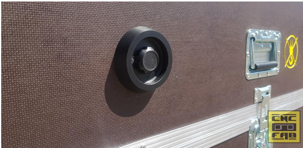
Main Transmission Transport Box