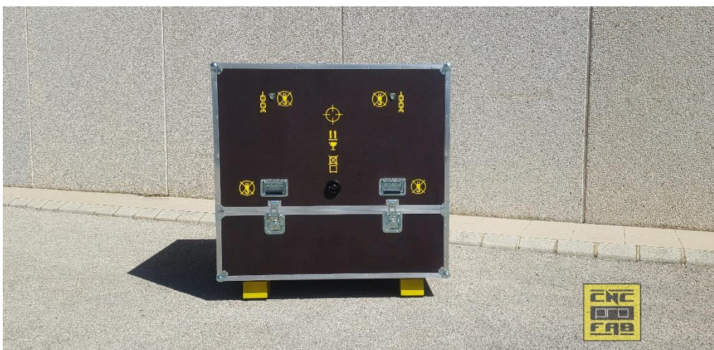
Main Transmission Transport Box