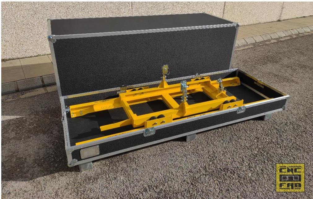
PT6C-67C Transport Box