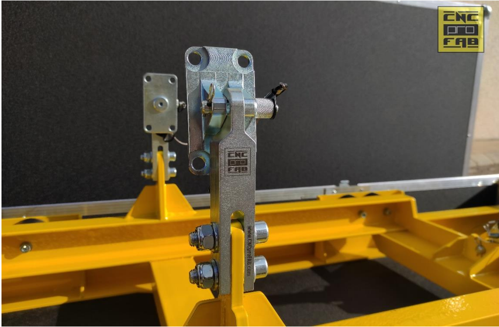
PT6C-67C Transport Box