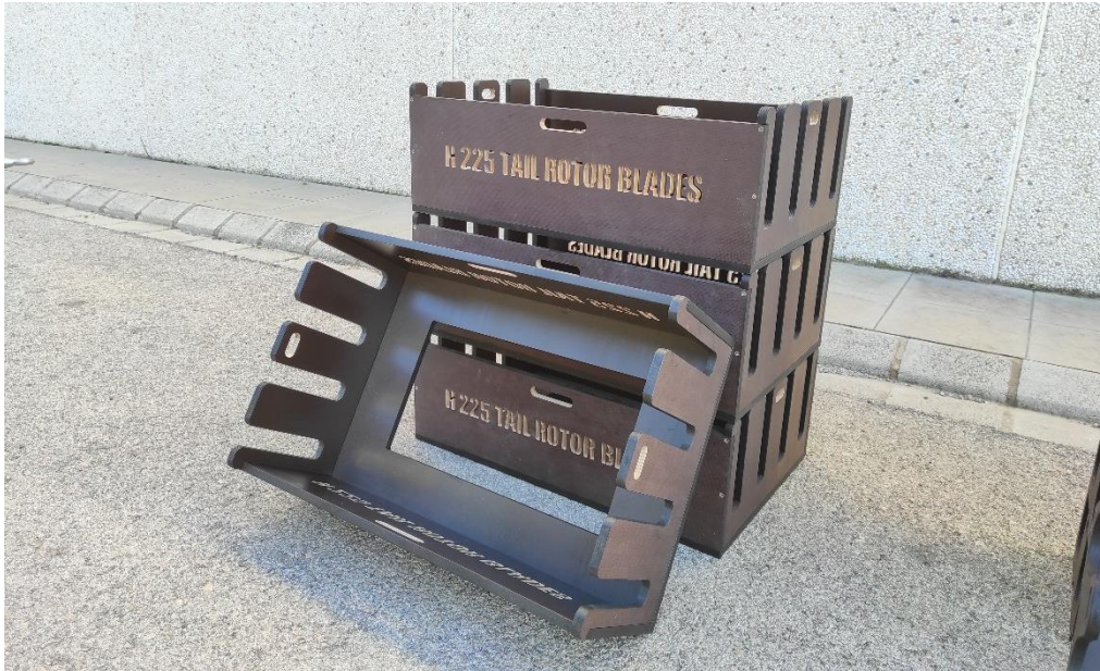
H225 Tail Rotor Blade Box