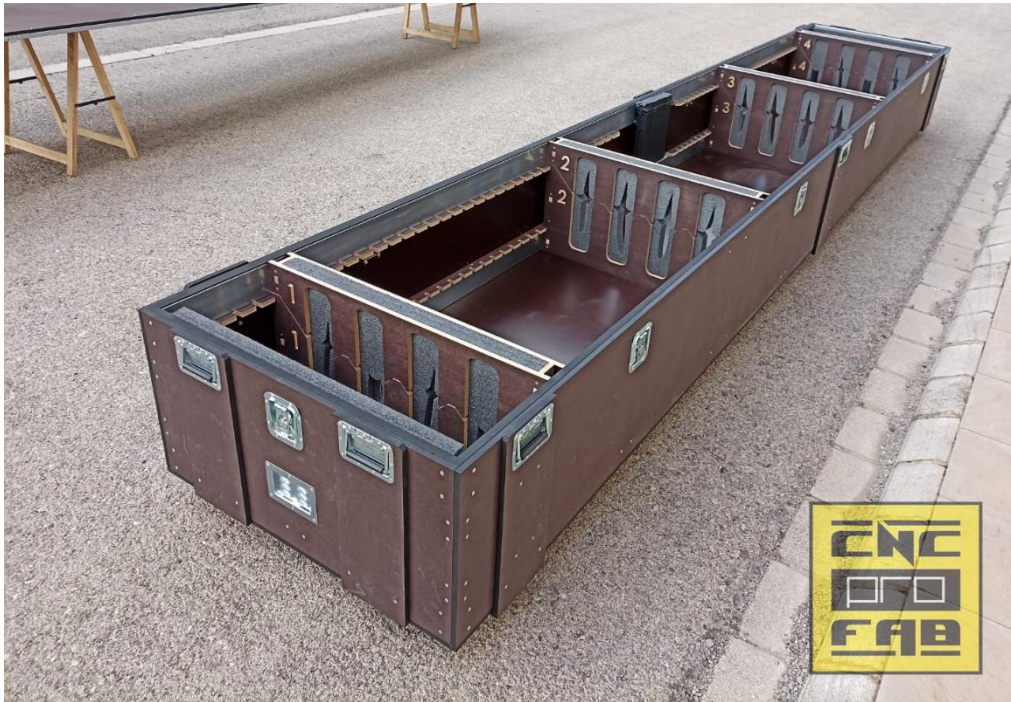
H145 Rotor Blade Box