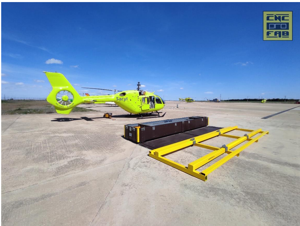
EC135 Sea Transport