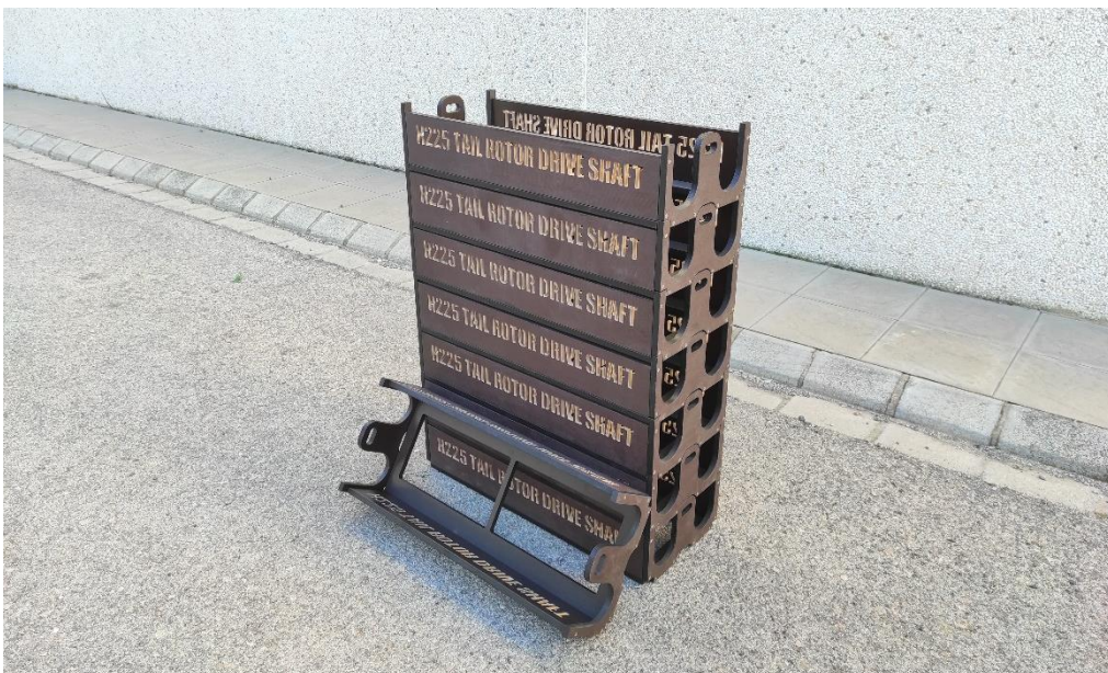
H225 Tail Rotor Drive Shaft Box