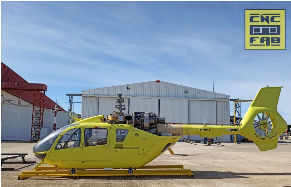
EC135 Sea Transport

We are specialised in large packaging for aircraft and components. We strictly follow the manufacturer's instructions and use approved materials.