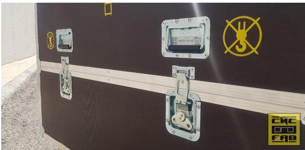
Main Transmission Transport Box