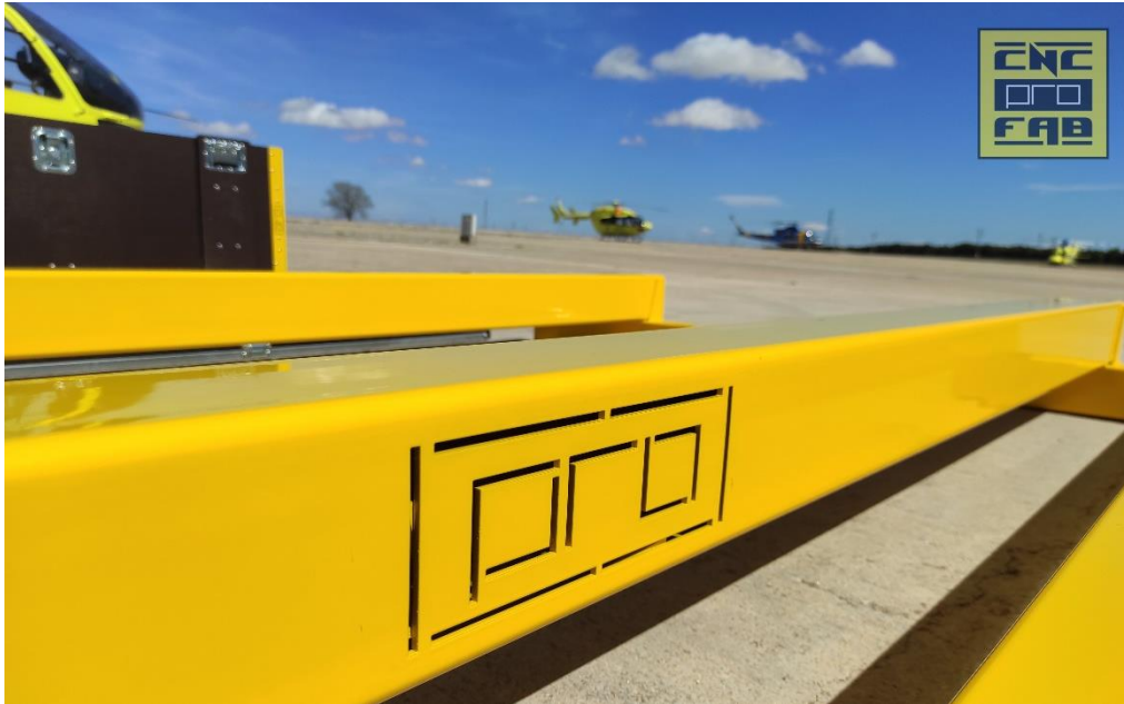
EC135 Sea Transport