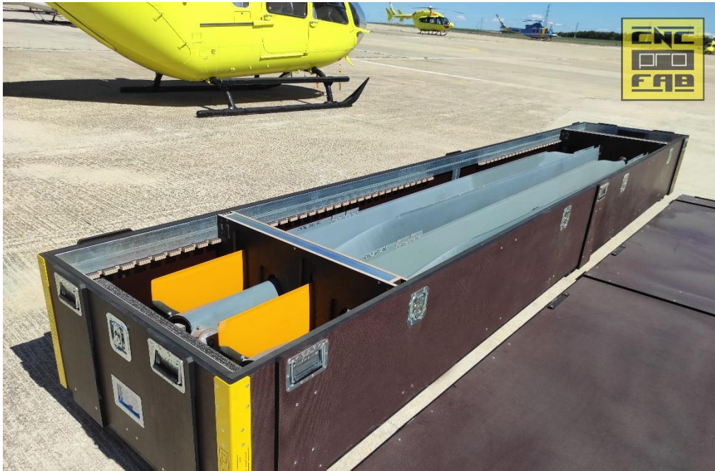
EC135 Sea Transport