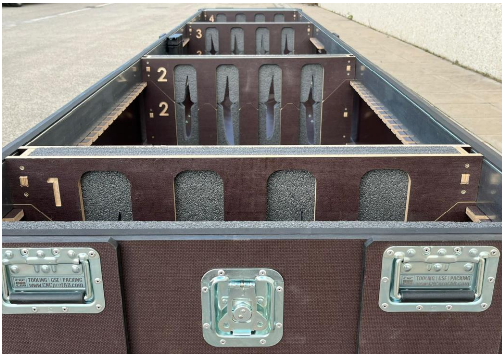
H145 Rotor Blade Box