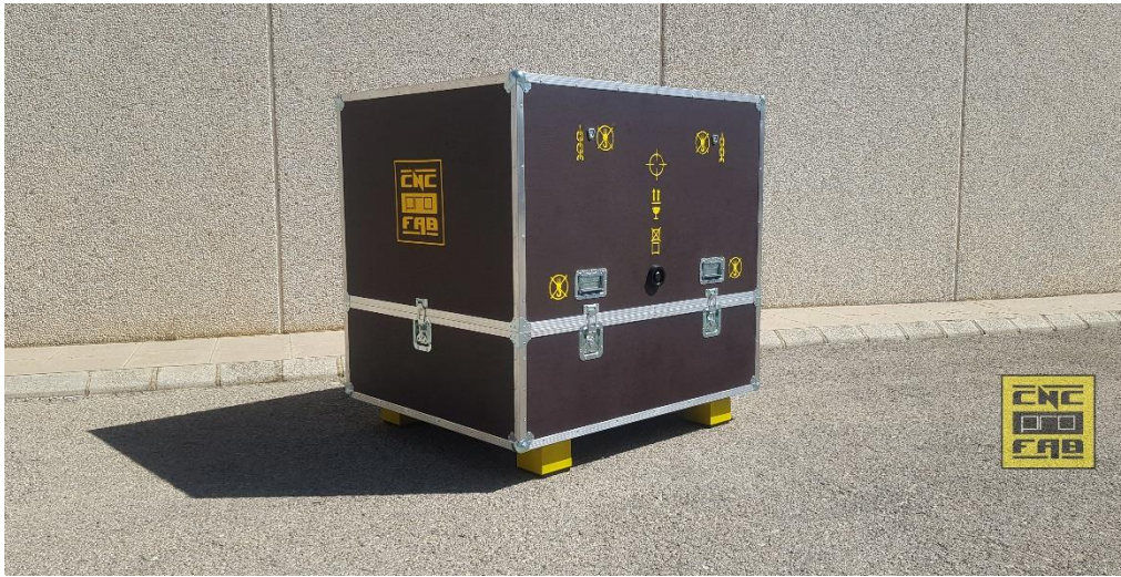
Main Transmission Transport Box