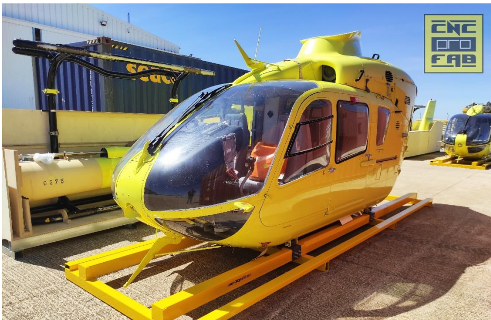
EC135 Sea Transport