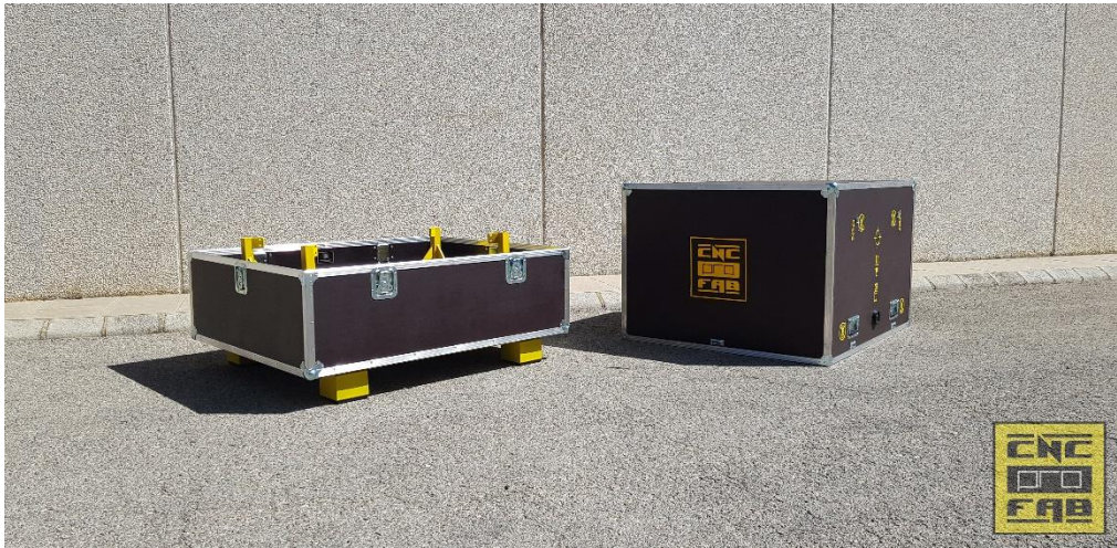
Main Transmission Transport Box