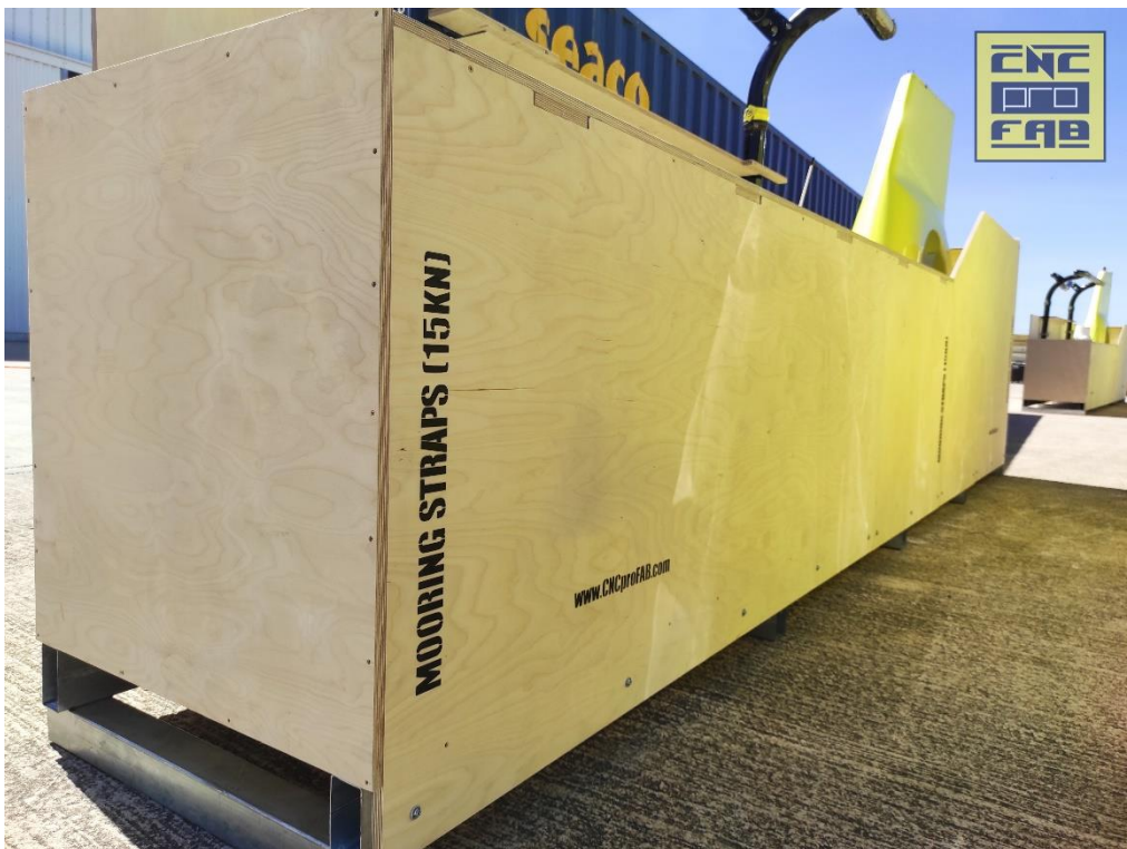
EC135 Sea Transport