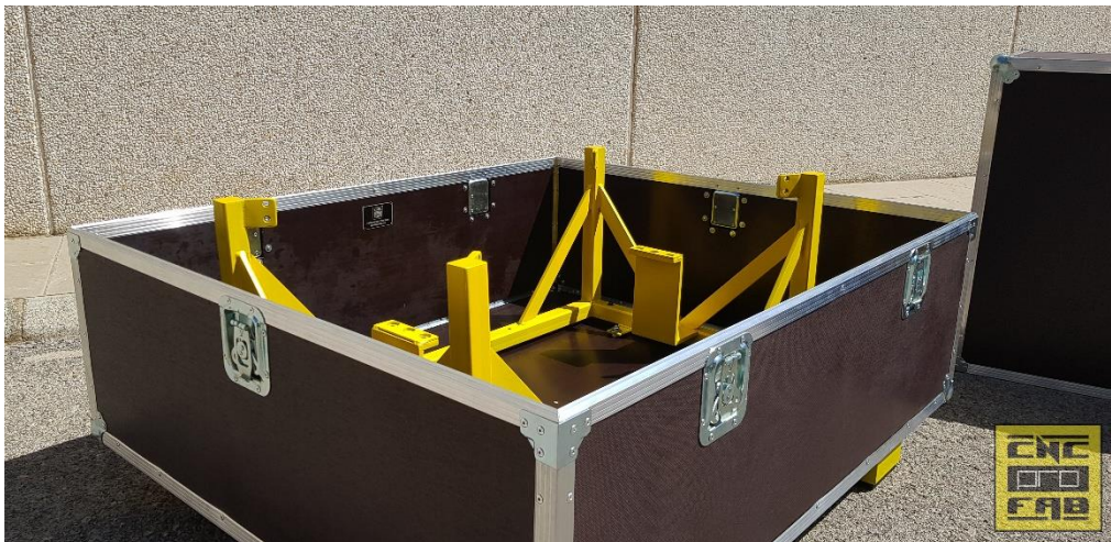
Main Transmission Transport Box