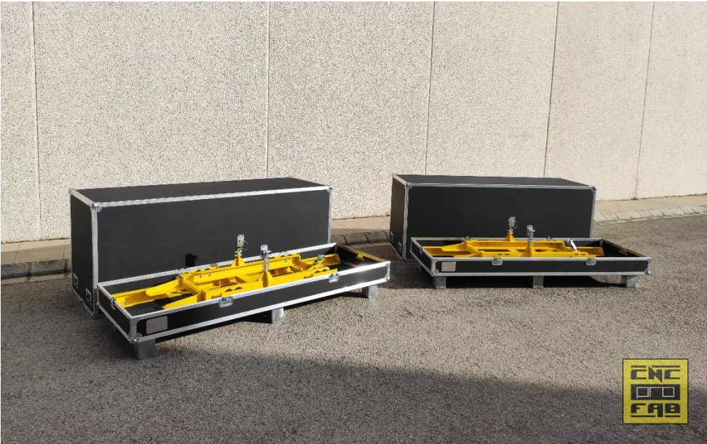
PT6C-67C Transport Box