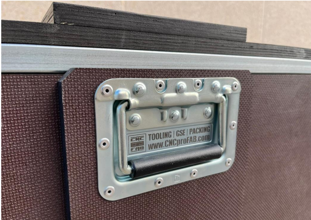
H145 Rotor Blade Box